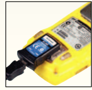
Easily download datalogged info