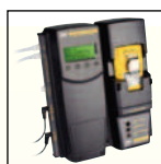
MicroDock II compatible