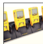
Five unit cradle charger

For a complete list of accessories, please contact BW Technologies by Honeywell.