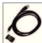
IR connectivity kit