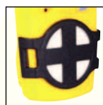
Auxiliary filter kit