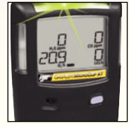
Black housing available