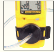
Simple calibration and bump testing